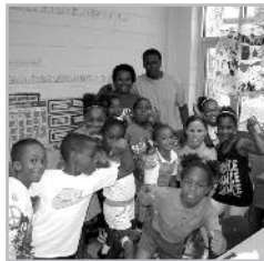
Get Fit Kindezi