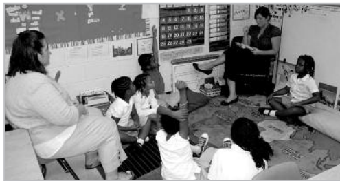
Creative Writing Club